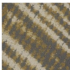
Golden 35210 LRV 23.3